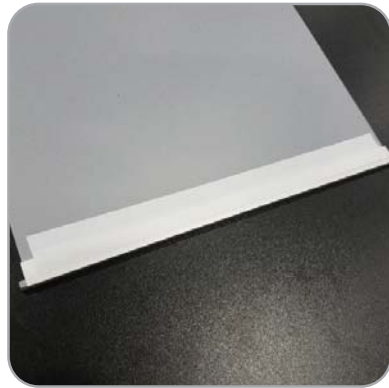
Take the re-enforcing tape and apply to the back of the banner and rail making sure there is even coverage between the two.