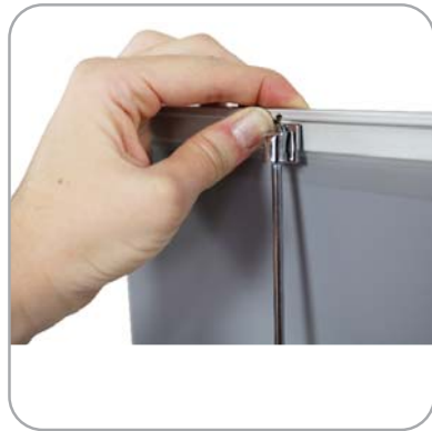
Pull up graphic and secure to poles.