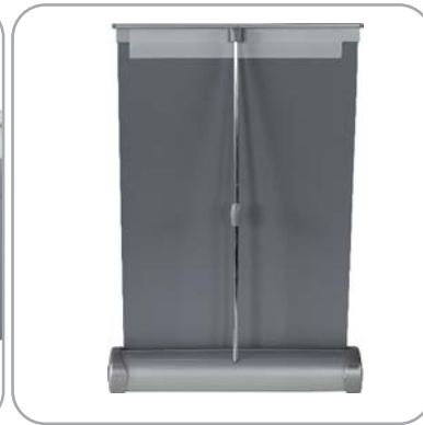
Unit is complete. Back view.