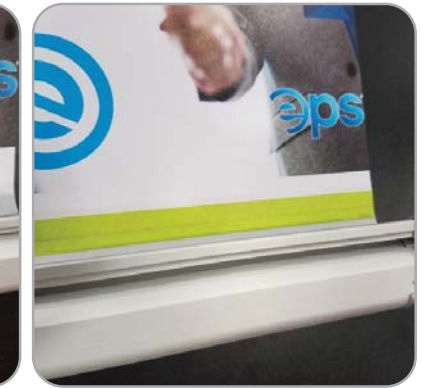
Apply tape to the bottom front of the graphic for extra re-enforcement.