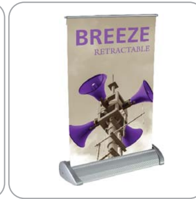
Unit is complete.