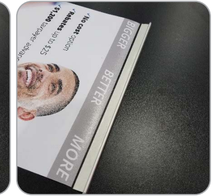
Apply graphic so that its even on both sides.