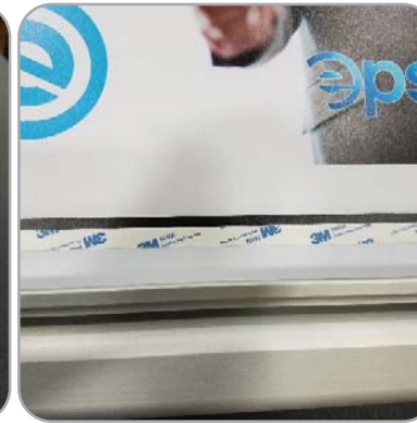
Line up graphic with leader strip.